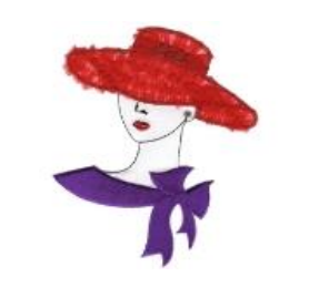
CLASSY, SASSY RED HATTERS OF GAV

Welcome to a new season of Red Hat activities!