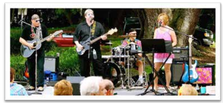
Feeling Groovy Band