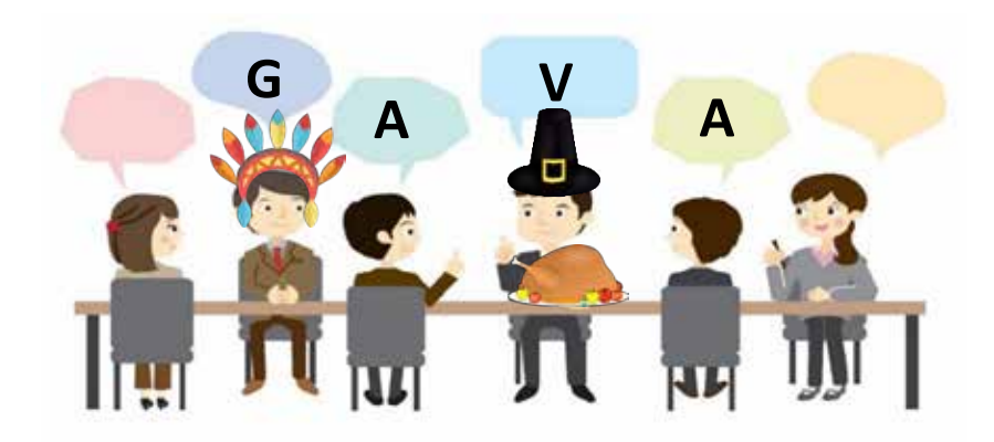
GAVA HOA President's Letter