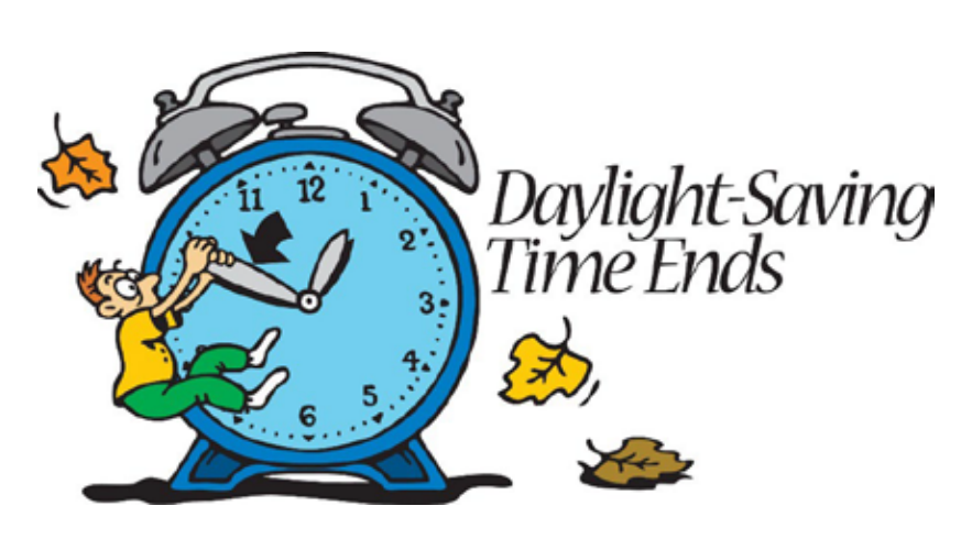
Fall back on November 5, 2023