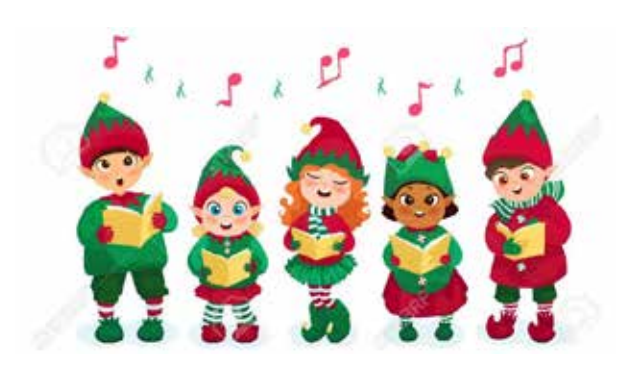
CAROLS in the CLUBHOUSE

Mark your calendars for Christmas caroling Thursday, Dec 7th in the clubhouse at 6:30pm. Practice some of your favorite songs and be ready to sing. Last year we had such a great time sharing these songs together. Punch and cookies will be provided but please bring snacks to share if you choose. I'm hoping to get in touch with Santa so you can have your picture taken with him. Come out, bring a friend, and have some fun. We might even have some door prizes.