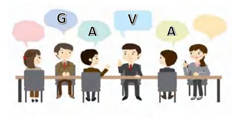
HOA PRESIDENT'S LETTER