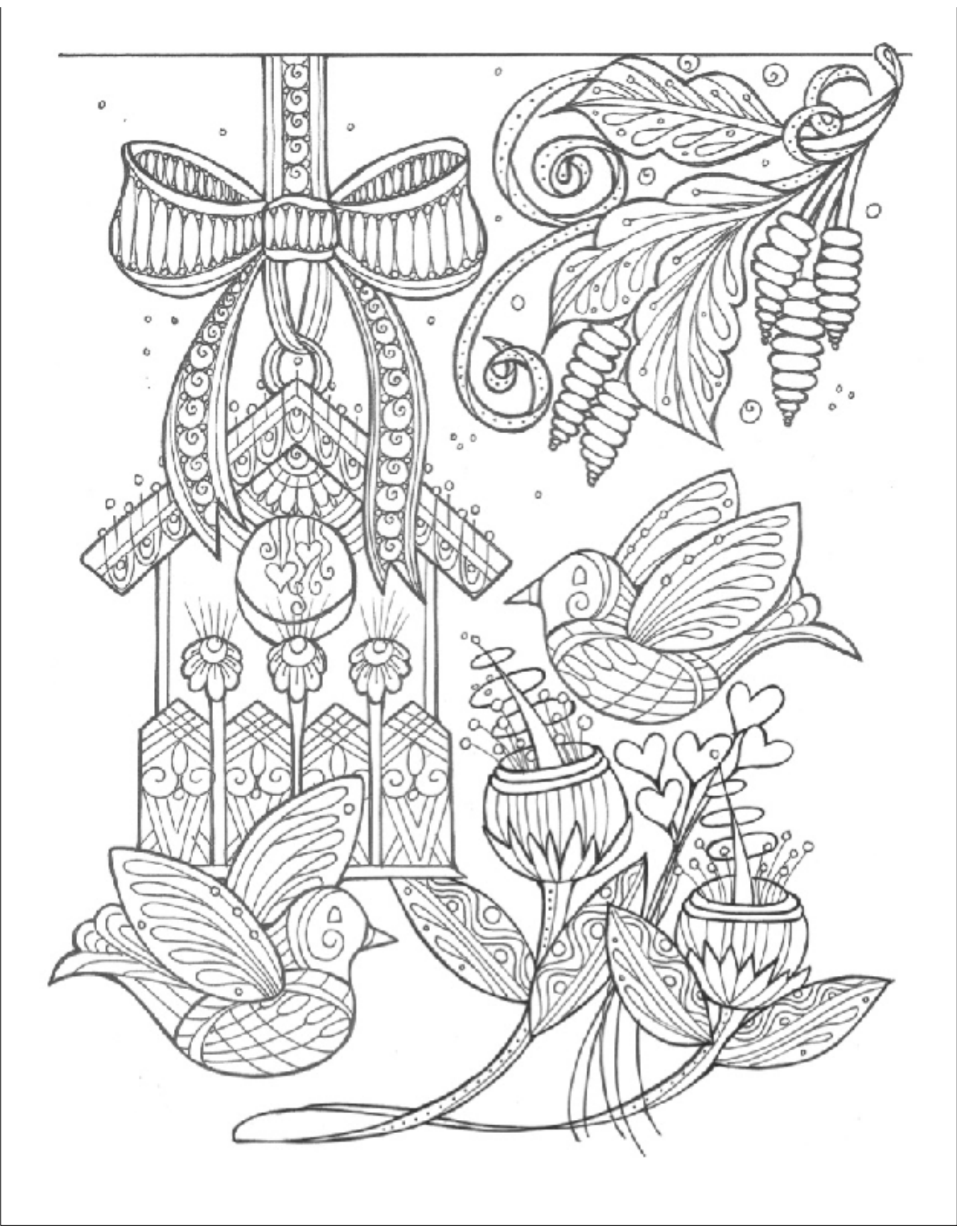
Color You Heart Out