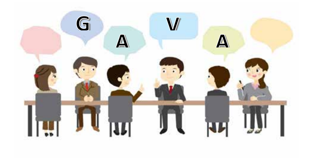
Wow, Wow, And Wow

As everyone is aware of the CORONAVIRUS and the effect that it is having on our Country, State, County, City and of course our community let me assure you that the health and welfare of our residents is, has been and will always be the number one concern for me and all of the GAVA BOARD MEMBERS.