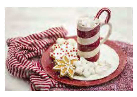
Saturday Dec. 5<sup>th</sup> & 19<sup>th</sup> 9:00 am