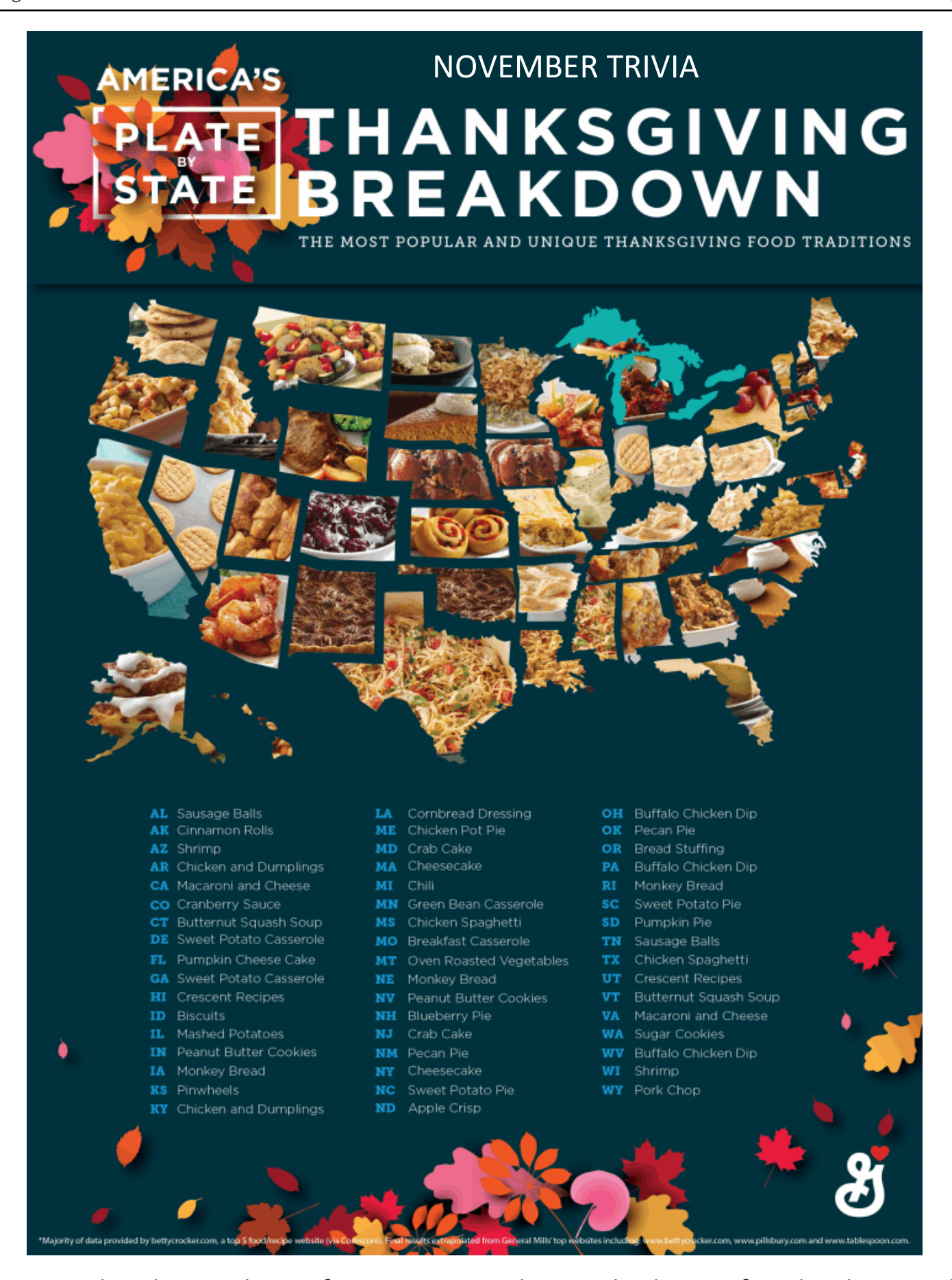
FYI: I lived in Michigan for 65 years and never had CHILI for Thanksgiving!

Page 18 - November 2019 Gull Aire Village