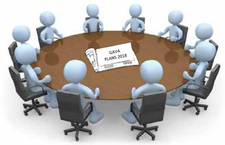
GAVA President's Report