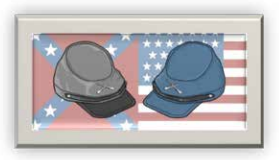
CIVIL WAR ROUND TABLE

Civil War Round Table meetings occur on the second Monday of each month at 11:00 AM in the Clubhouse. Our next meeting will be Monday, February 12, 2018 at the Clubhouse. On the agenda will be preparations to promote the Film Club's April presentation of The Free State of Jones.