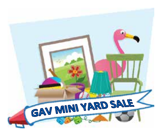
Shed Mini-Yard Sale December 1 10AM - 11AM

Gene and Phyllis Henricksen 727-421-6614